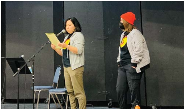
Friends from Tsuru for Solidarity, this year's beneficiary share more about justice causes.