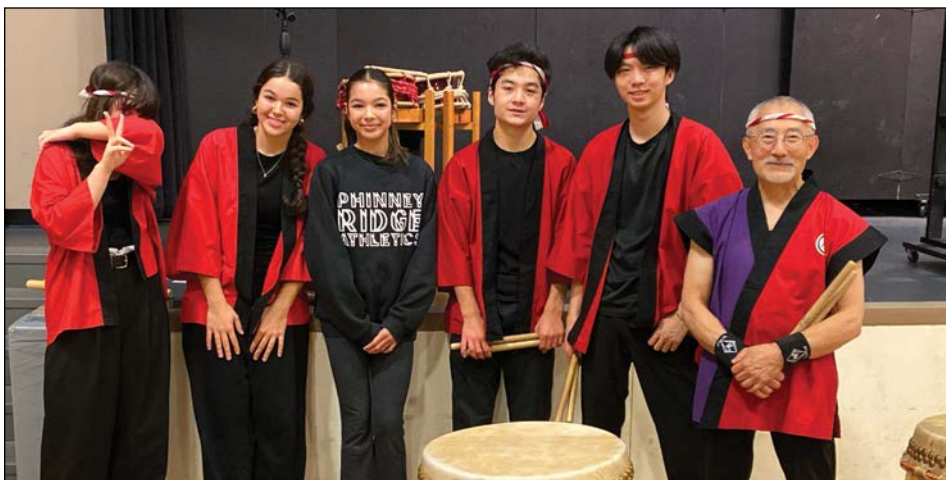
Kaze Daiko graced Blaine Memorial UMC with a couple of performances after Sunday Worship Service. Kaze Daiko is a young taiko group based in Seattle teaching communities about resilience through music and to not have fear!