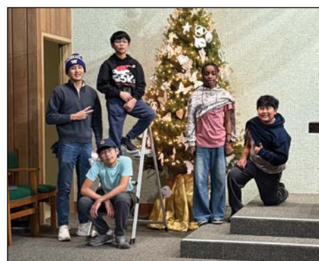
Volunteers of all ages helped decorate Blaine Memorial UMC during the Greening of Blaine. As we enter the Advent and Christmas season, what are your hopes for the community and the world around you? Is God at work?