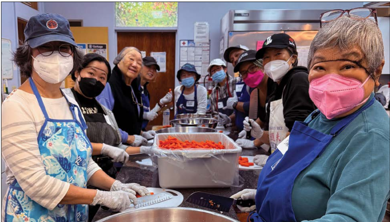
Members and friends of Blaine Memorial UMC prepare carrots and other vegetables for curry to sell at this year's Bazaar benefit event. What are ways we can continue to bring together Church and community?