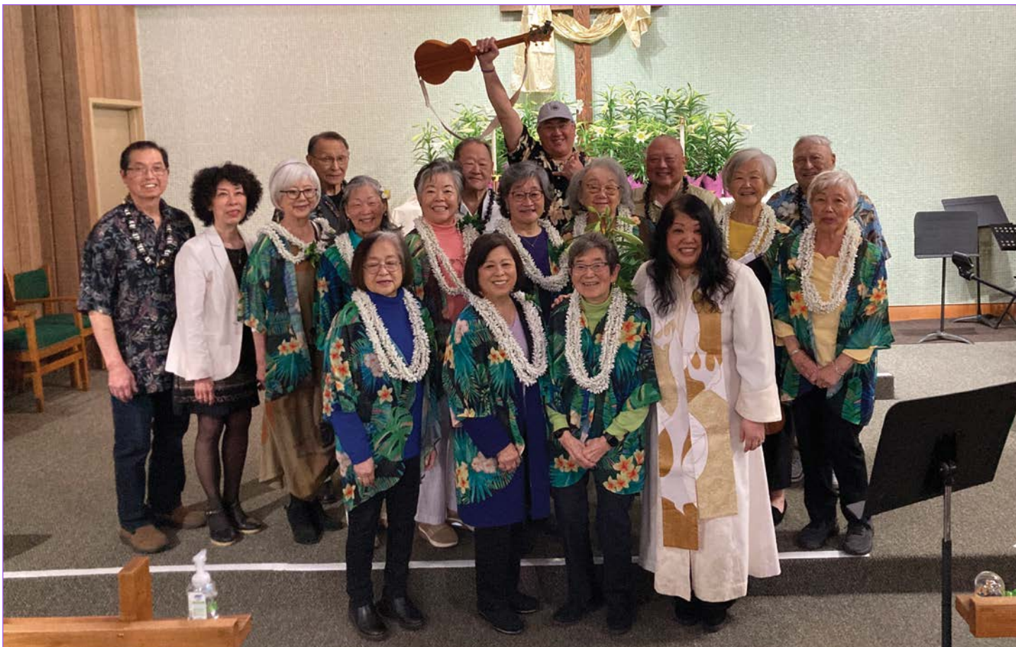
The Blaine Ukulele Group of Seattle (B.U.G.S.) celebrates finishing a musical set on Easter Sunday!