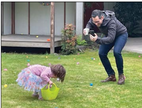
A proud dad watches his daughter pick up an egg.