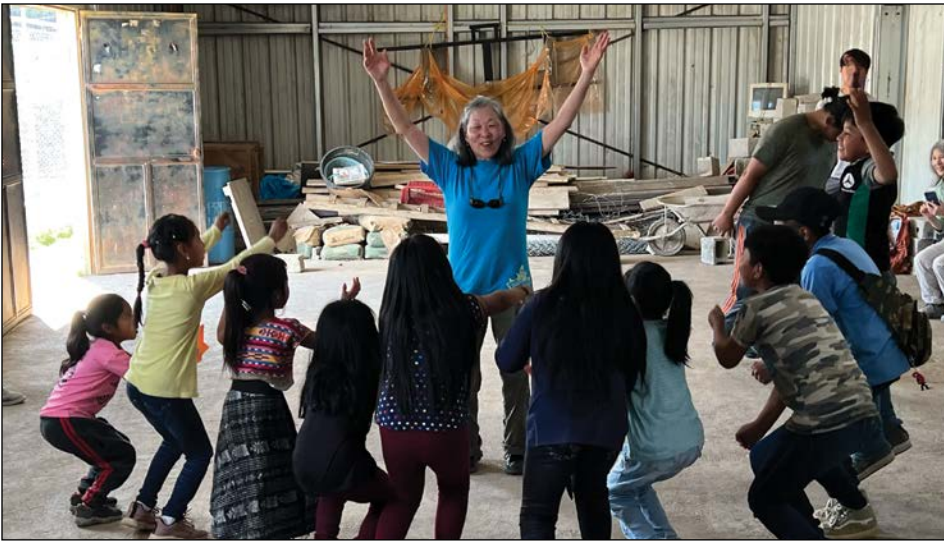
Along with kitchen construction and dental care, the Mission Guatemala team held Vacation Bible School for about 30 children in the local Mayan community.