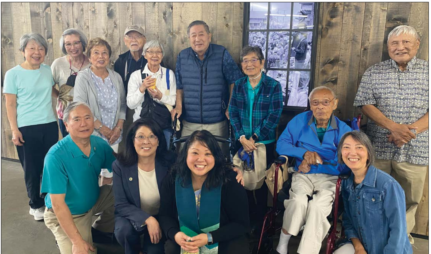
Puyallup Assembly Center and Incarceration Camp survivors attended Survivors Day at the soft opening of the Puyallup Remembrance Gallery at the Washington State Fairgrounds on August 15, 2024.

Let this special time of autumn and change transform and enlighten you. Be courageous, be kind, and be the hope for the future!