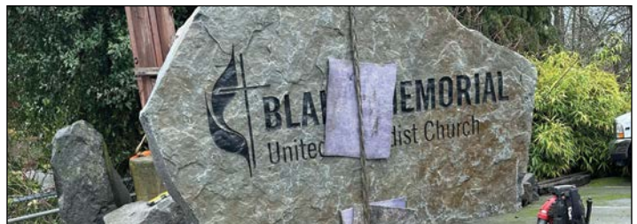
Blaine Memorial's new sign was installed by T. Yorozu Gardening Co.