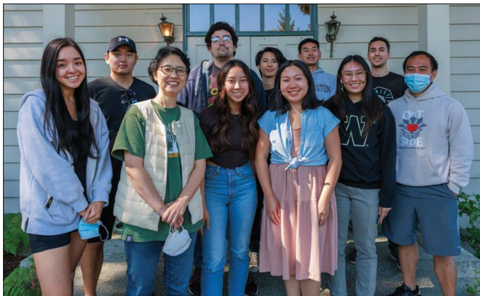
The 2023 Young Adult BYG Leadership Retreat in Mercer Island, WA.