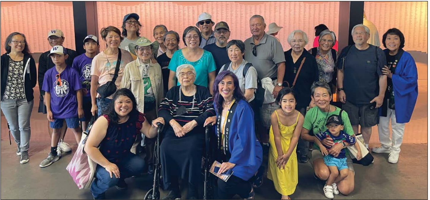
Blaine Memorial UMC church members attend Opening Day at the WA State Fair to view the Remembrance Gallery.