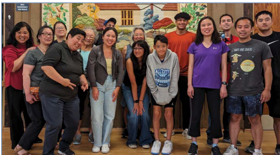
In 2023, the Innovation Hub hosted a family movie night in September! IH events like this provided opportunities for people of all ages to gather and enjoy meaningful, inspirational fellowship with friends of all ages.