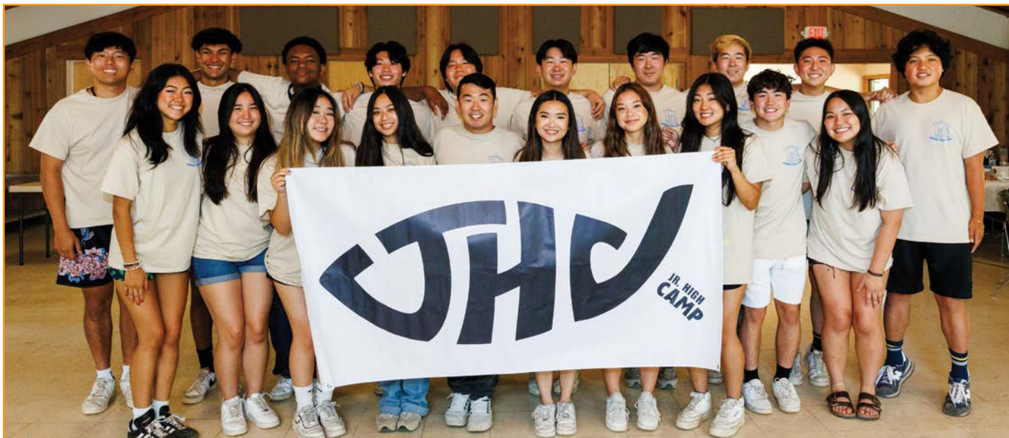
Junior High Camp (incoming 6th-9th grade) was held on June 23-28, 2024 at Camp Lodestar in Wilseyville, California.

T he theme for Junior High Camp this year was “Trust”. We followed Isaiah 26: 3-4, a song about Trusting in God. But what does it look like to trust in God?