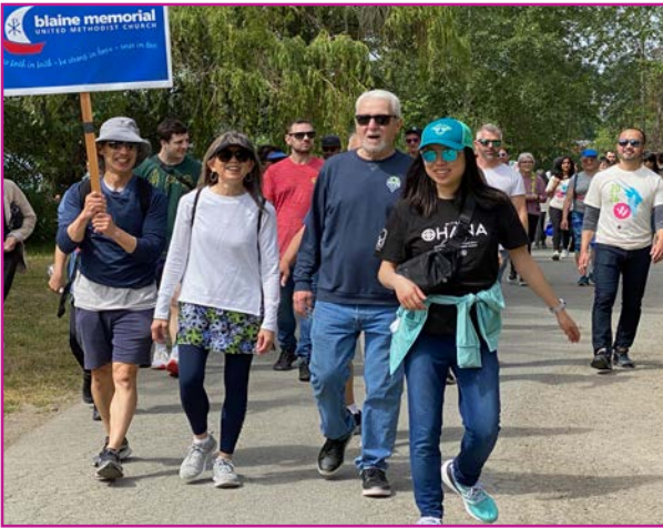
Several members and friends of Blaine Memorial participated in the annual Walk for Rice event held at Seward Park last June.