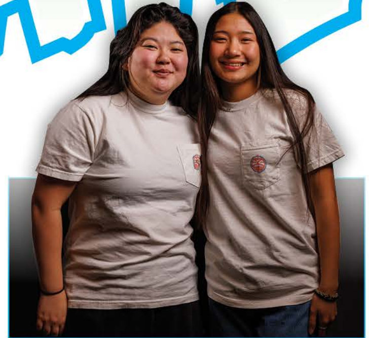
Contact members of the Blaine Youth Group to purchase your own shirts, hoodies, and more in support of camping ministries!

BYG meets on Sundays at 10:00 AM. We will gather in the Sanctuary for the beginning of worship service before transitioning over to the Nishida Room for BYG time after the children's message.