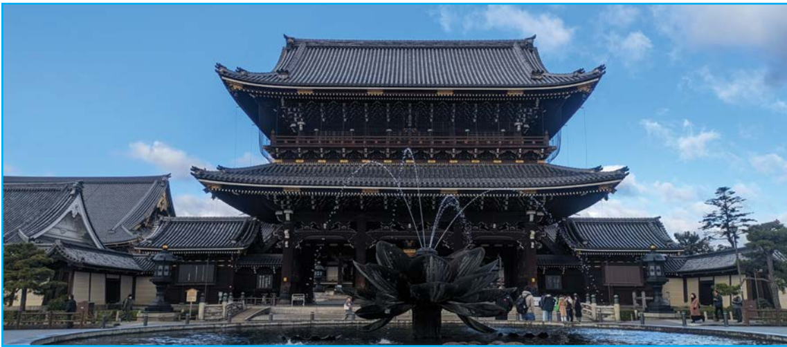
The Founder's Gate at Kyoto's Higashi Hongan-ji Temple was a magnificent sight!