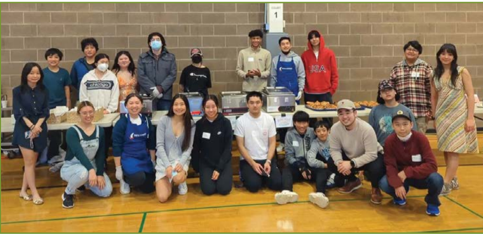
The Blaine Youth Group served a delicious Easter Breakfast consisting of eggs, fruit, pancakes, and sausages in support of Blaine's Camping Ministries.