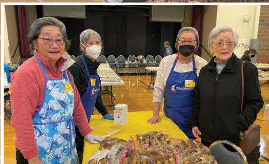
Volunteers finish packing baked goods.