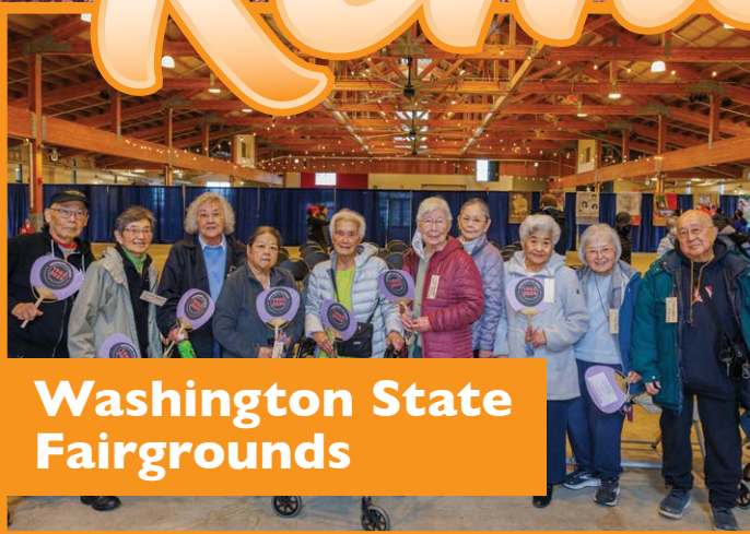
Washington State Fairgrounds