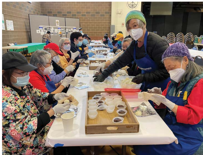
Church members make ohagi before Sukiyaki opens!