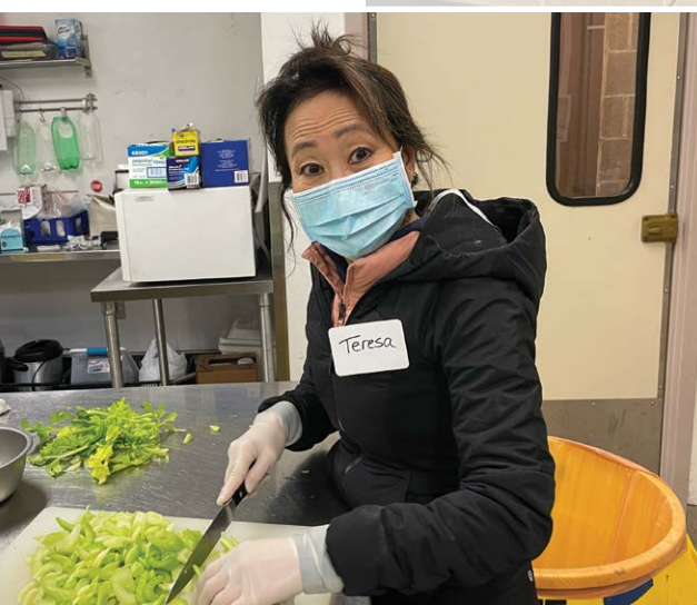
Chops celery for the Sukiyaki.