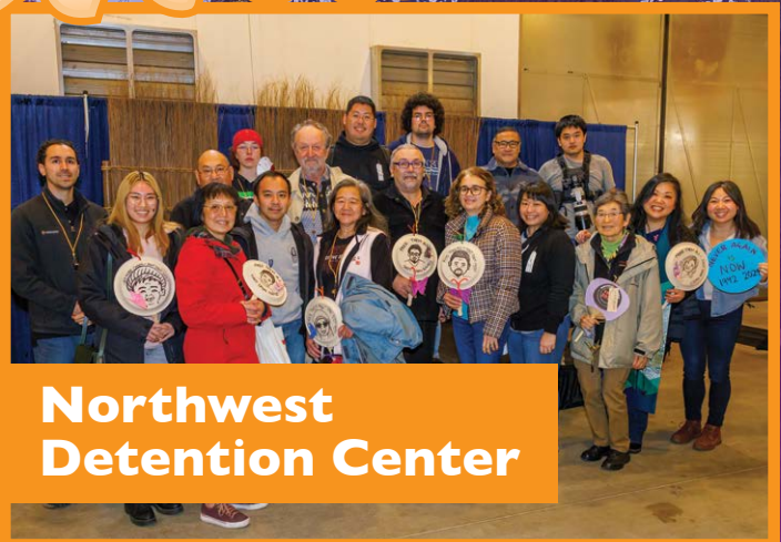
Northwest Detention Center