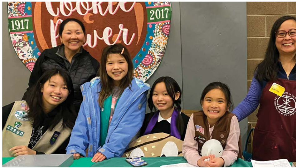
Blaine Memorial UMC's Girl Scout Troop sells cookies at Sukiyaki!

In Christ's name, Committee Leaders for Sukiyaki Dinner 2024