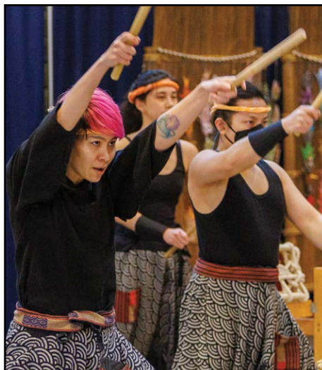
Taiko drummers perform at the Washington State Fairgrounds, last February

The remembrances began with a ceremony in Puyallup, WA at the Washington State Fairgrounds which