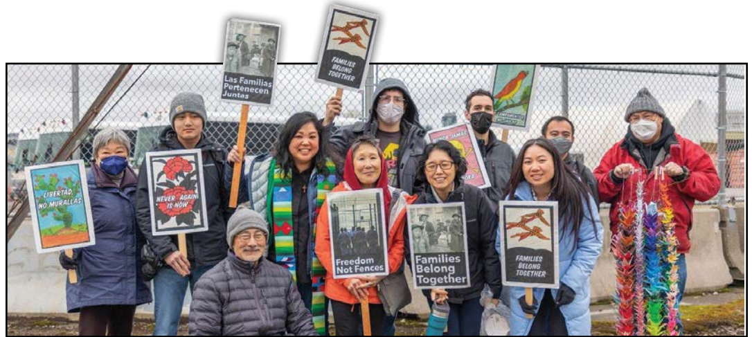
Last year at the Day of Remembrance Part II, members of Blaine Memorial UMC caravanned to the Northwest Detention Center in Tacoma, Wash. The solidarity with the Japanese American community and those who are in the NWDC link the past and present injustices, drew attention to worsening conditions inside NWDC.