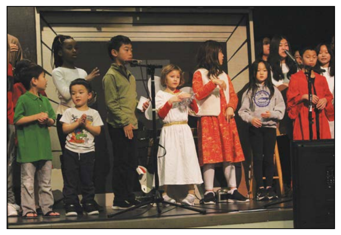
The children of Blaine Memorial presented their play, "Breaking News! The Savior is Born!"