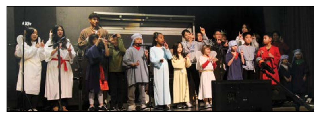
Our children performed during their annual Christmas play on December 10.

As the days grow darker, we draw closer to the arrival of the Light that turns the world upside down—or right-side up! The journey toward and beyond the manger is one of reversing expectations, encountering what we thought we already knew in brand new ways, and receiving good news in unexpected places.