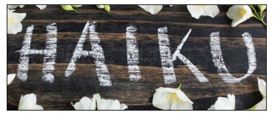
Your writing talents are needed! Submit your poetry about the season, now!

Sunday, Dec. 24, 5PM Christmas Eve Candlelight Lesson and Carols Service