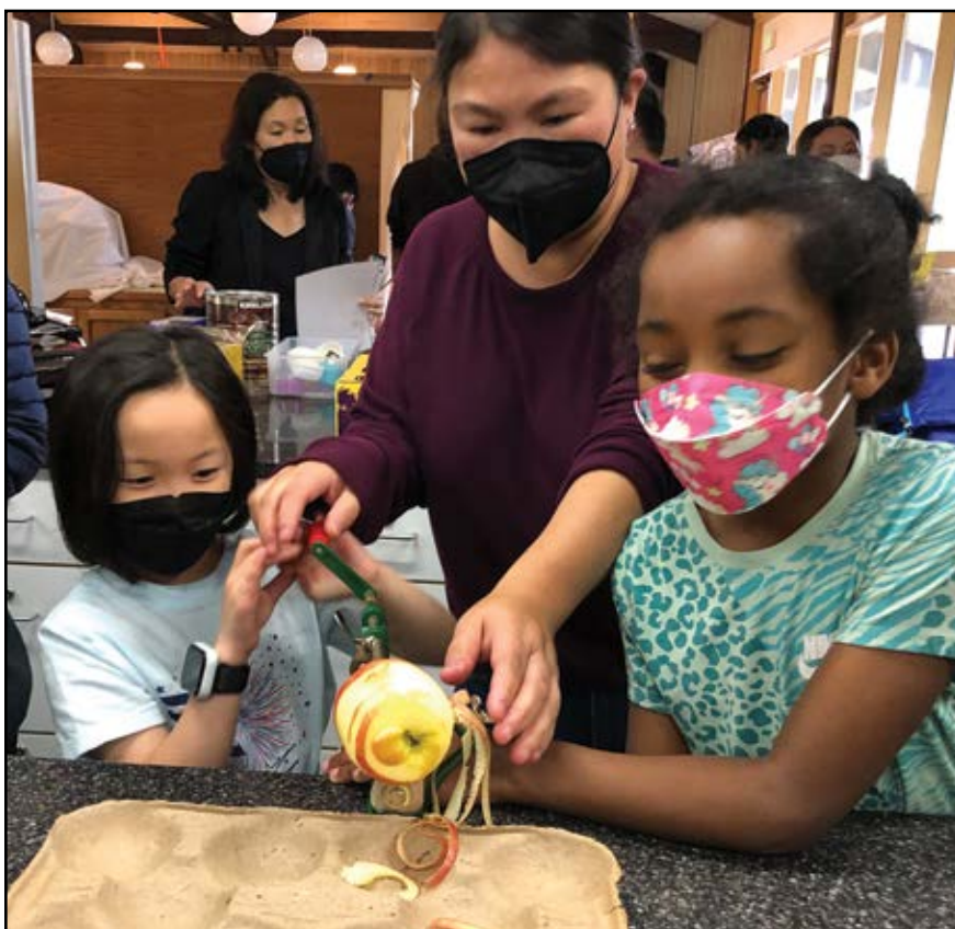
Our young folks and parents prepare peeled apples to make apple crisp as part of a hearty Thanksgiving meal for Kimball Elementary School families.