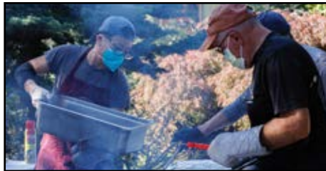
Volunteers grill delicious chicken teriyaki during Bazaar.