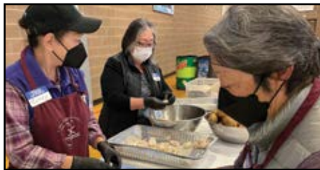
Volunteers shred chicken for udon.