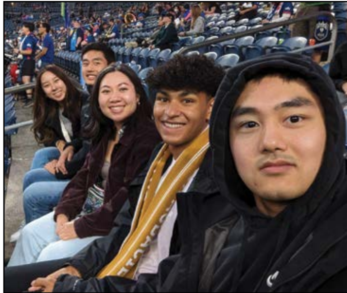
Blaine Memorial's Young adults checked out the OL Reign at Lumen Field to help nurture its fellowship with fun and soccer.

Since June 2022, the Reconciling Ministries Team has been leading the congregation in study and discernment about what it means to be an open and affirming church. One of the most important ways we can align ourselves with justice and reconciliation is to affiliate with the Reconciling Ministries Network (RMN), an organization of United Methodist congregations committed to the full inclusion of LGBTQIA+ people in The United Methodist Church. After over a year of questioning, learning, and discussing,