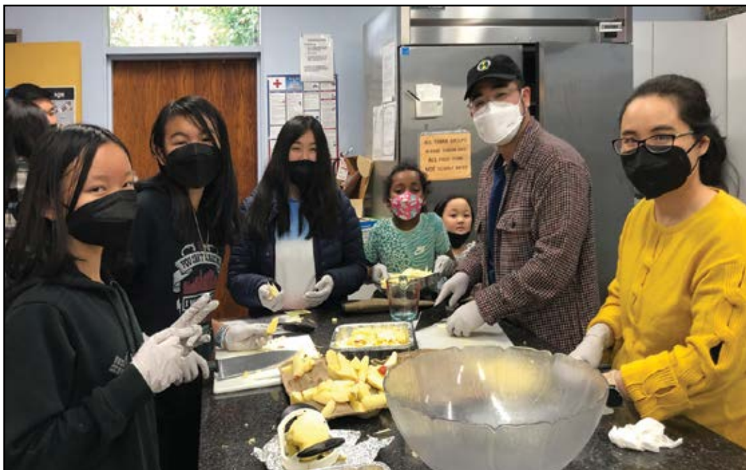
Blaine Memorial Youth peel and chop apples to make apple crisps. Their work will help support families at Kimball Elementary School.