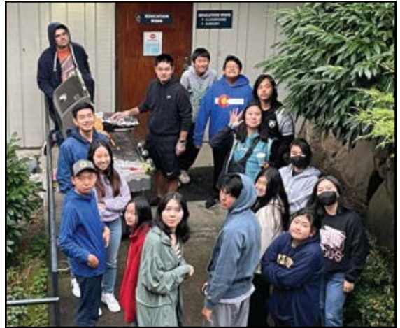
The Blaine Youth Group practices making Suno Dogs.