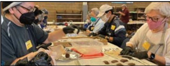
Ohagi, or sweet rice balls, are made by our volunteers.