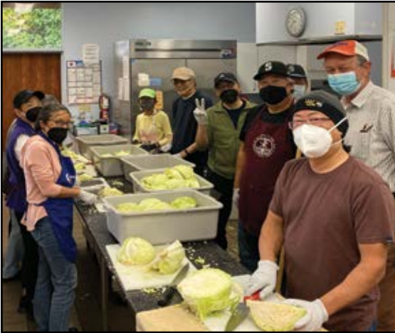
Friends prepare Tsukemono, or salt-pickled cabbage.