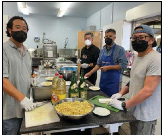
Our team helped marinate bbq chicken for the grill!