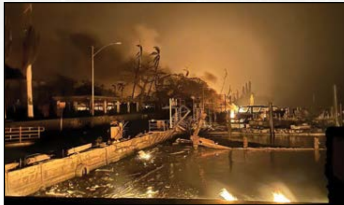
On August 8, the island of Maui experienced a major wildfire disaster fueled by windy and dry conditions. As of the time of writing, much of the community of Lahaina was considered destroyed and 97 fatalities had been discovered.

We are to just give of ourselves generously