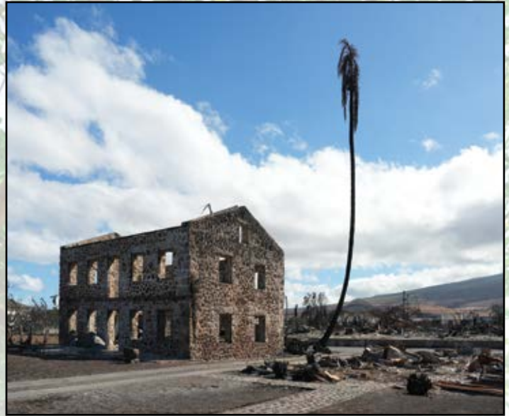
Burned out cars and the remains of buildings are seen in Lahaina town in this image captured Wednesday by U.S. Civil Air Patrol. View is on 900 block of Front Street, looking Northwest.