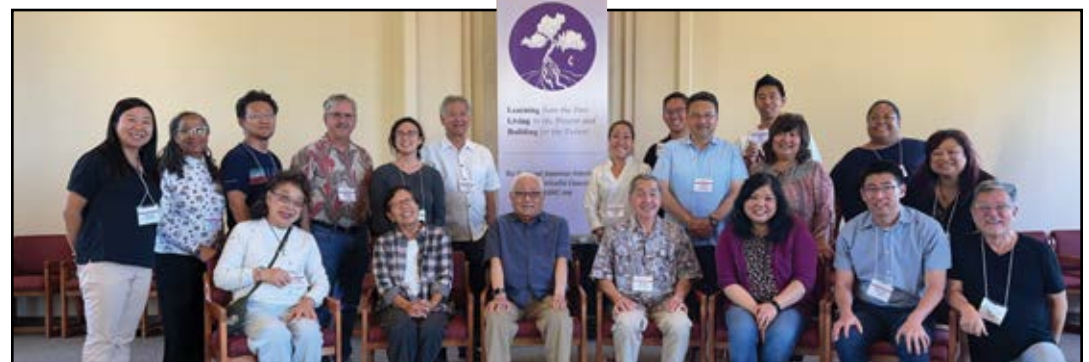
NJAUMC Clergy gather to discuss their dreams for the future of the historical UMC JA churches.

are also of every age, race, ethnicity, physical and mental ability, level of education, and family structure, and of every economic, immigration, marital, and social status, and so much more. We acknowledge that we live in a world of profound social, economic, and political inequities. As followers of Jesus, we commit ourselves to the pursuit of justice and pledge to stand in solidarity with all who are marginalized and oppressed."