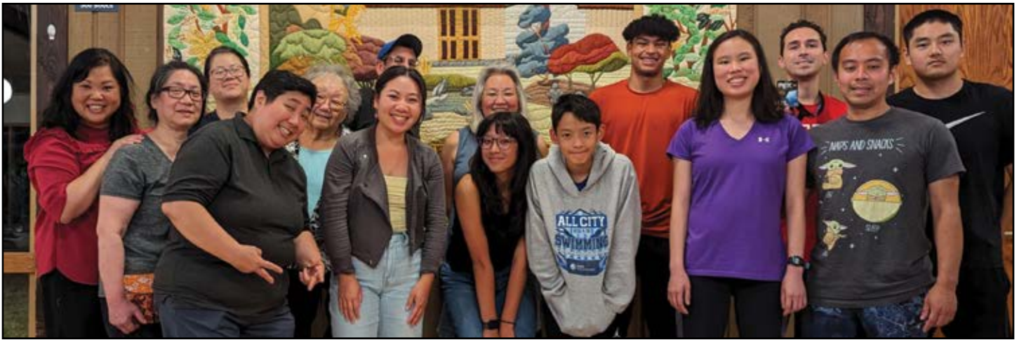
The Innovation Hub hosted a family movie night in September! We gathered for food, fellowship, and a movie screening. Our film nights are opportunities for people of all ages to gather and enjoy meaningful, inspirational, or thought-provoking movies.