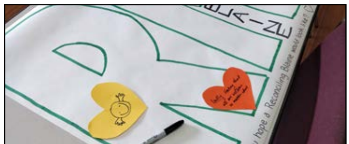
Reconciling Ministries drop-in Q&A session.