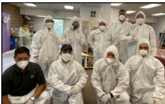
We replaced old BYG room ceiling tiles with the help of parents and adult volunteers.