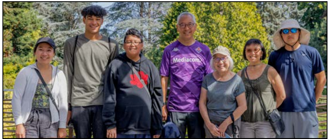
Blaine congregation members visit Kubota Gardens in a contemplative silent walk to mindfully reflect on the symbolic significance of the beautiful Japanese garden before them.

The Reconciling Ministries team hosted a drop-in activity and Q&A session during social hour on July 30. The team offered