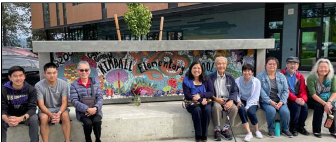
Blaine Memorial UMC members attended the grand opening of the new Kimball Elementary School. Kimball kept the original sign which is at the front of the entrance.