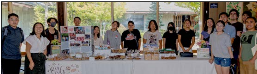
The BYG youth held our first Bake Sale of the new school year providing delicious treats to help raise funds for our summer camp ministry expenses.