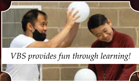
VBS provides fun through learning!