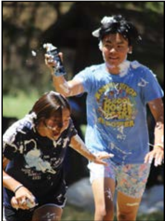
Our BYG campers enjoy a fun week of Asian Camp with plenty of outdoor games, worship, workshops, and the “messy day” experience.