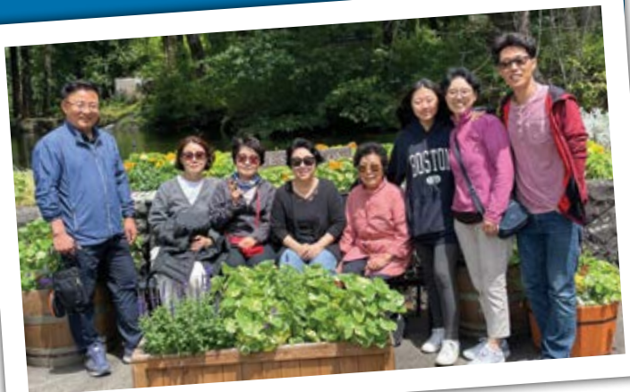
The family drove alongside the Columbia River Gorge area where the family kept shouting, "It's so gorgeous!"

My plan to have my mom and a sister in June ended up including my mom, three sisters, and one brother-in-law. During the pandemic, my family's ability to host guests diminished. I thought having two guests at a time would be manageable and thought it would become a great opportunity to begin hosting families in the future.