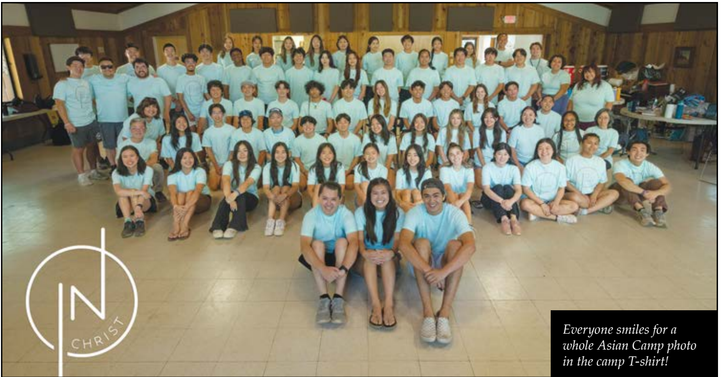
Everyone smiles for a whole Asian Camp photo in the camp T-shirt!