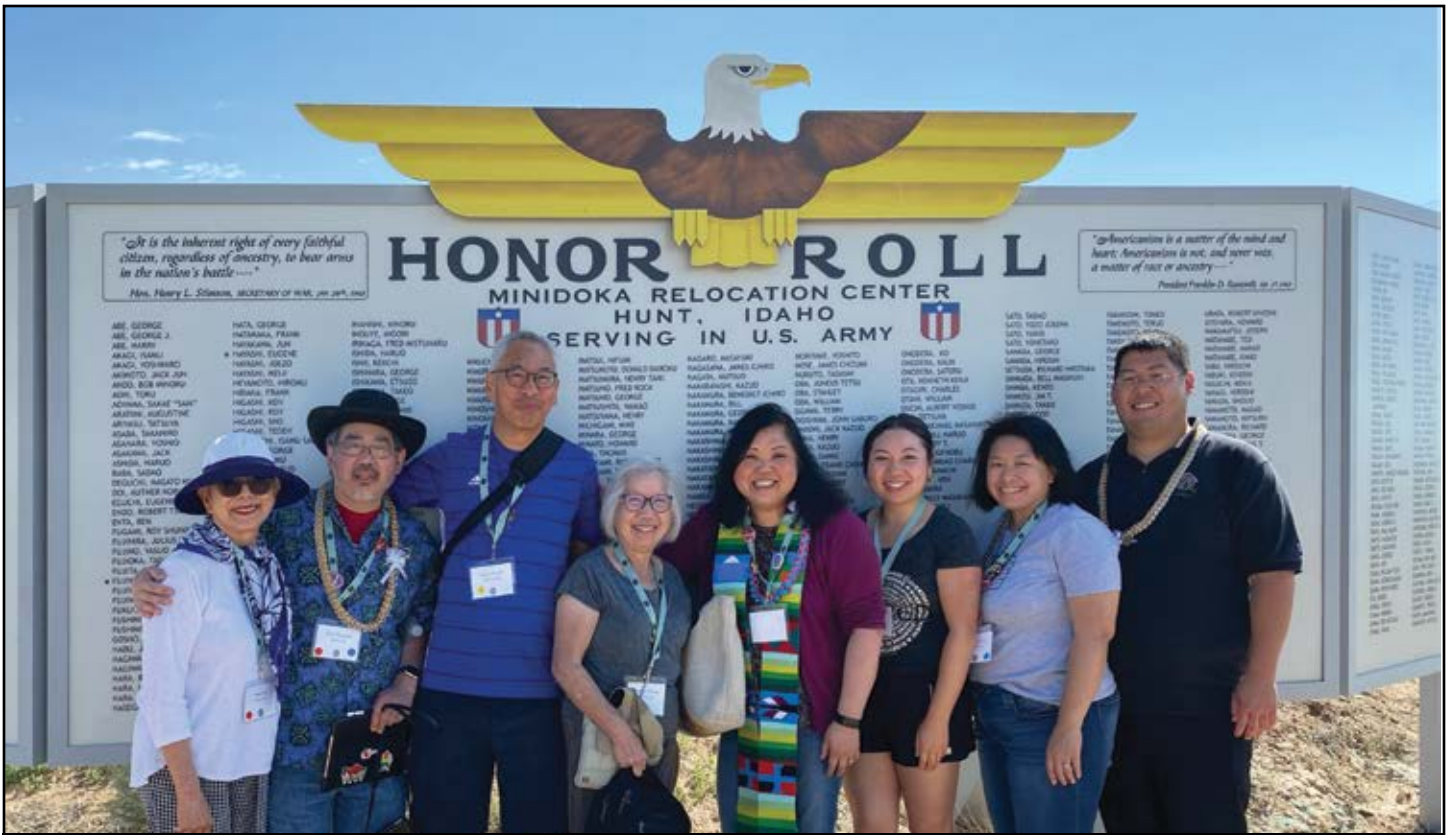
Blaine Memorial UMC members gather around the newly revamped Miniidoka Honor Roll with an additional 150 names added.