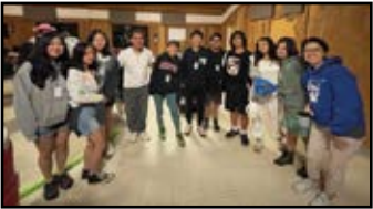
Below: Two group photos of the Blaine Memorial youth campers at Jr. High Camp.