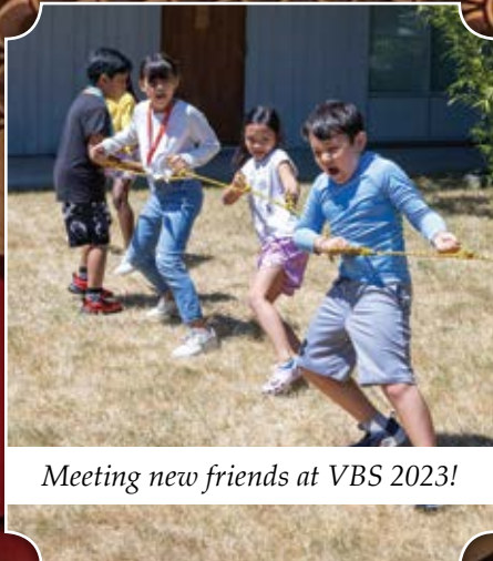
Meeting new friends at VBS 2023!