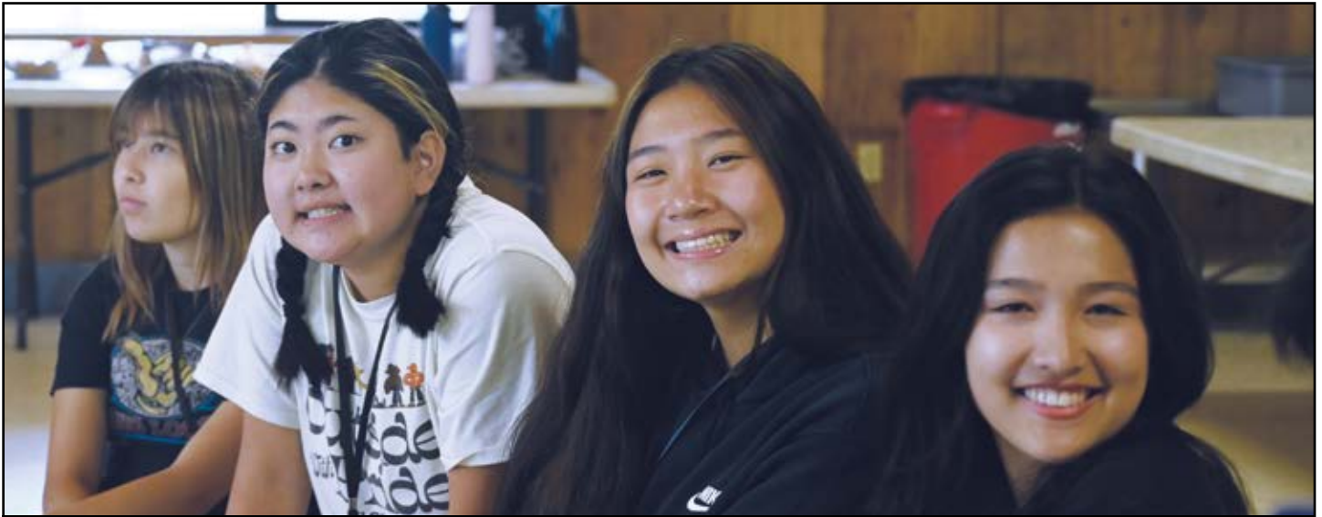
Our Blaine Memorial youth pose for a snapshot while listening to an Asian Camp reflection story at Camp Lodestar.