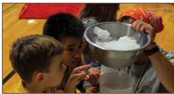
The children at VBS learned about science, too!

There were countless individuals who played vital roles behind the scenes, working hard to bring everything together. From the talented hands that crafted the decorations, including the food truck, to those diligently creating the daily special signs and lending their fish kites, their selfless acts of service were