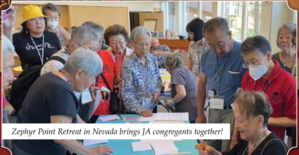
Zephyr Point Retreat in Nevada brings JA congregants together!