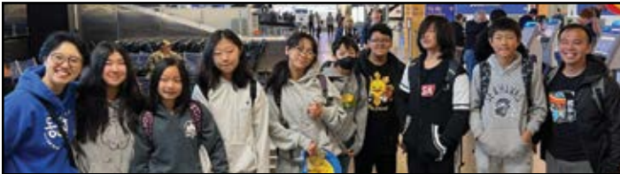
The JHC campers and adult chaperones gather for a photo at the airport before taking off for camp.