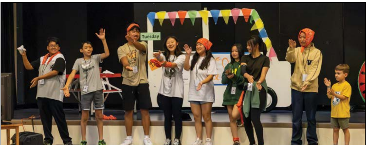
VBS Leaders and Shepherds lead the VBS campers with Food Truck Party in song and dance!