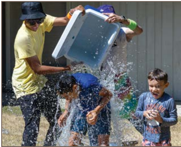
It's time to cool off at VBS 2023!