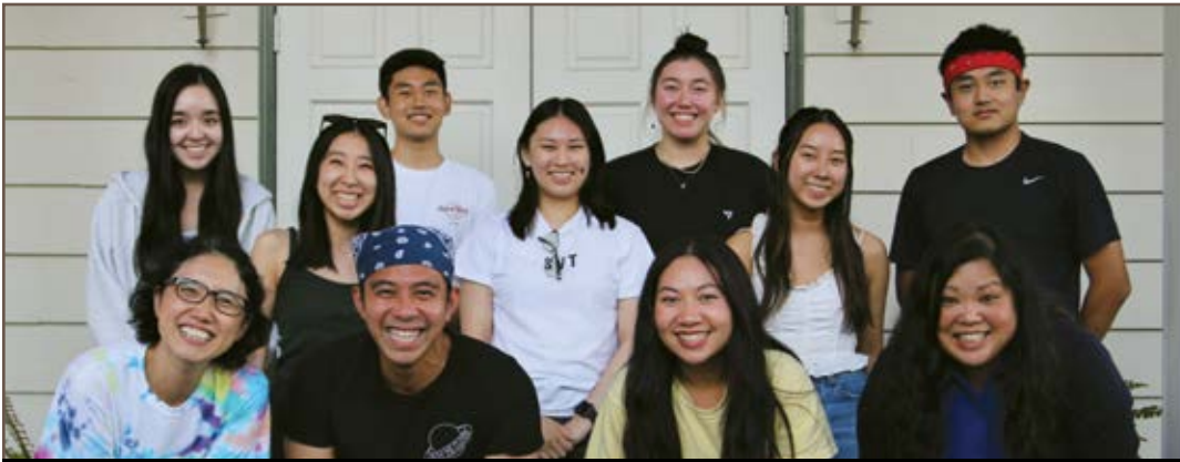
The BYG leadership team poses for a group photo at their leadership retreat last year (August 2022). We couldn't do BYG without our leaders and directors!