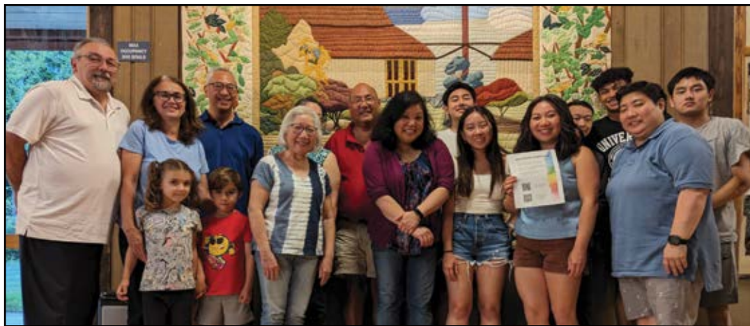
The Innovation Hub hosted a viewing of "UnUnited: Fighting for LGBTQ Inclusion in The United Methodist Church" with discussions and fellowship.

I'd like to see the local church asking more self-reflective questions, like: "What's the role of the local church? What is the purpose of our particular church community in this neighborhood at this time in history?" Once a church can identify its context