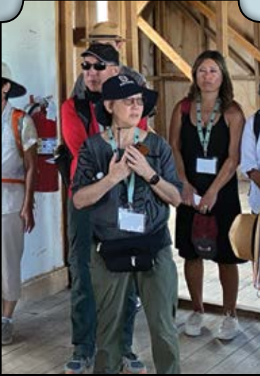
Reflecting on the past...