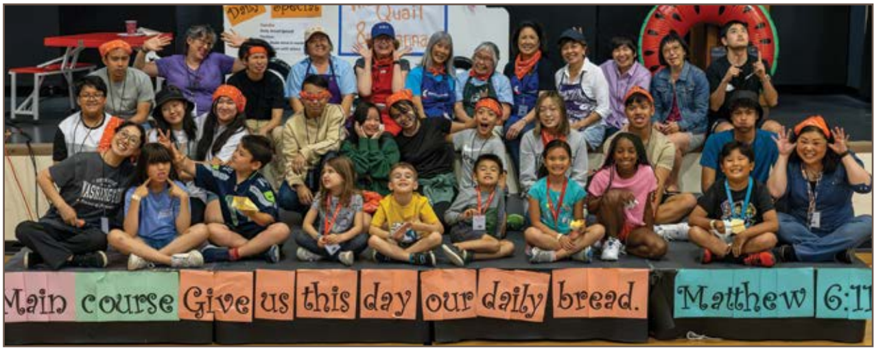
This year's VBS provided quality time with our young people and adults alike. What was your favorite moment?