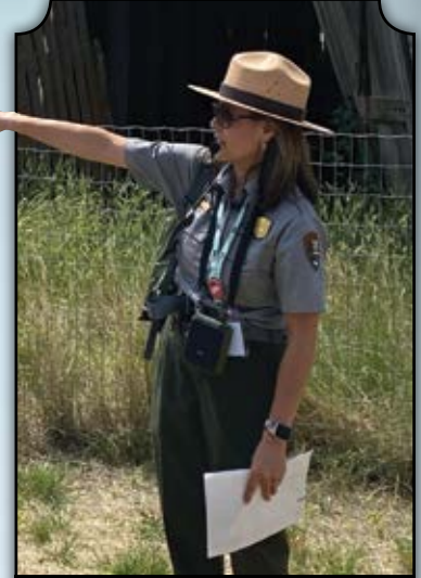
Planting for the future.