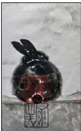
"Looking Back" by Fumiko Kimura