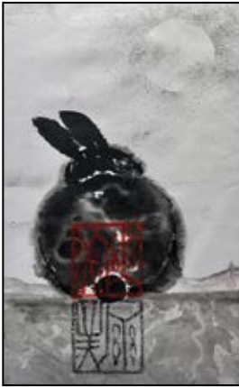
"Looking Back" by Fumiko Kimura