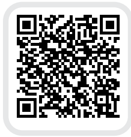
Download the PDF for more information