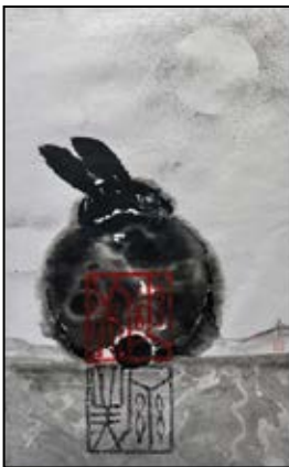
"Looking Back" by Fumiko Kimura

Register by 6/25/23: https://www.njaumccamps.org/ac-2023-registration