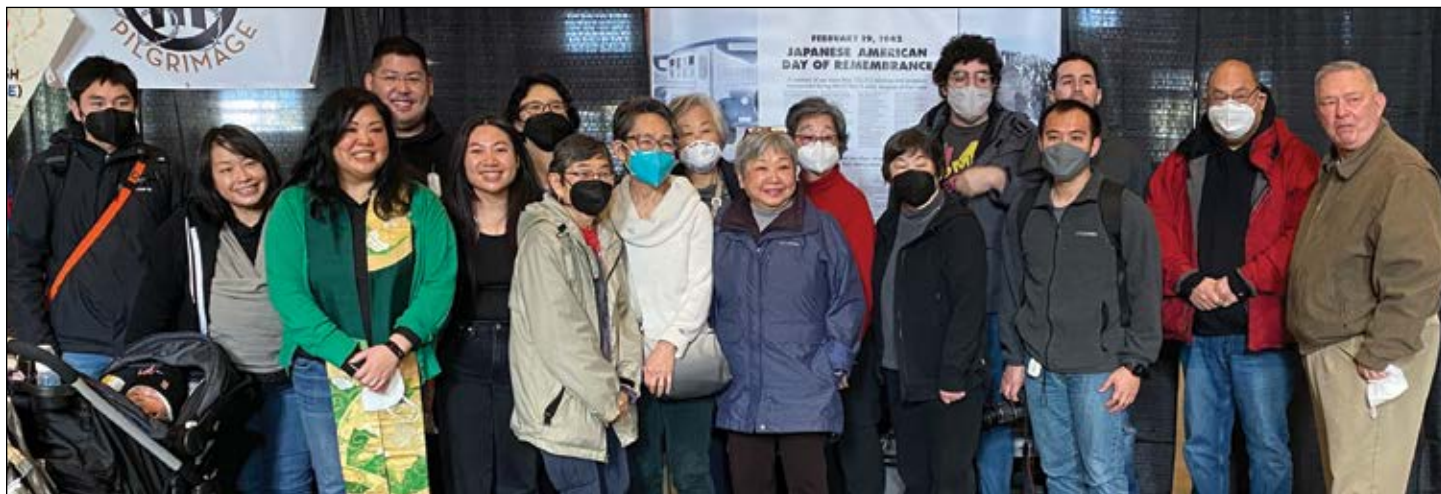
Representation Matters: Members from Blaine Memorial UMC attended the Day of Remembrance Ceremony at the Washington State Fairgrounds on February 18, 2023. Many of the members were either survivors or have family members who were sent to the Puyallup Fairgrounds 81 years ago when it became an Assembly Center before heading to the Minidoka Incarceration Camp.