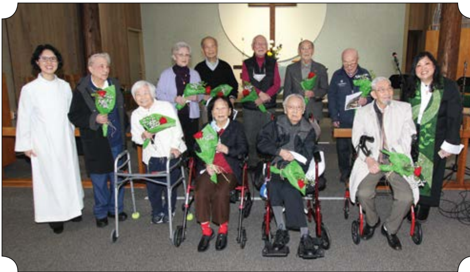
Anniversary Sunday: We honored our 88+ church members in worship on January 29.