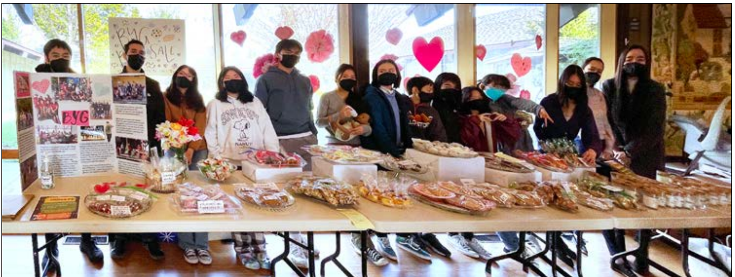
The Blaine Youth Group welcomes the congregation for delectable snacks and fragrant candles during it's Bake Sale fundraiser