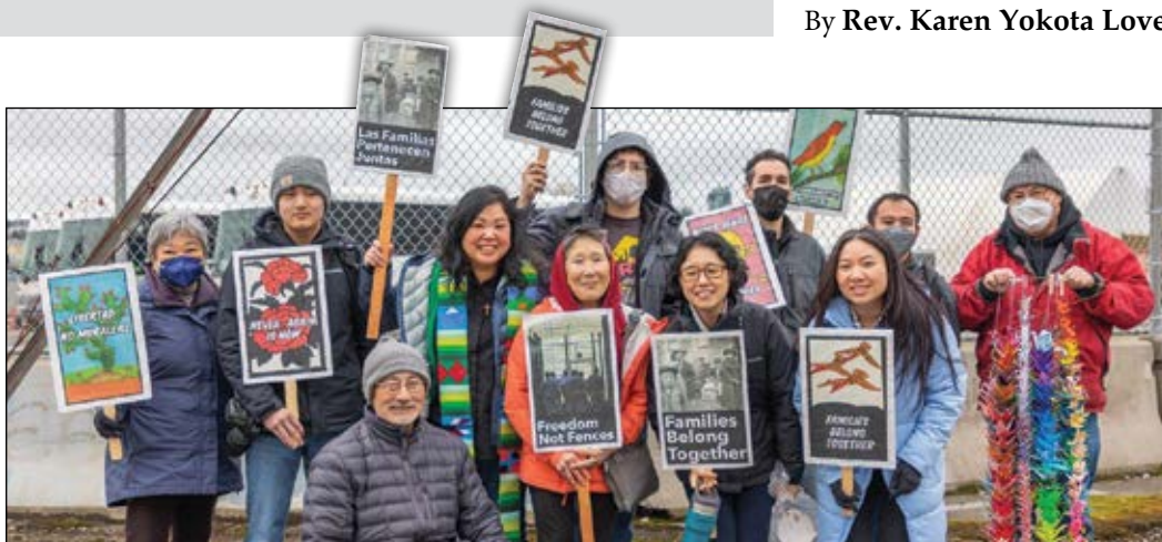
In Solidarity: Day of Remembrance Part II included a caravan to the Northwest Detention Center in Tacoma, Wash. The solidarity with the Japanese American community and those who are in the NWDC link the past and present injustices, drew attention to worsening conditions inside NWDC.