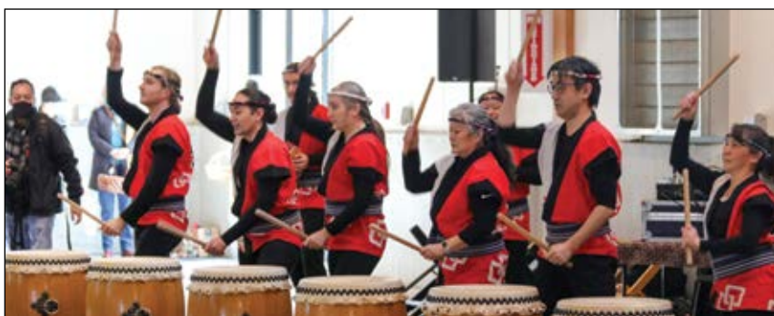
The Beat of the Drum: Seattle Kokon Taiko opens and closes the ceremony with a few powerful musical pieces.